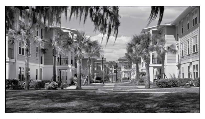
Janie's Garden-Phase I was Sarasota HA's first mixed-income development. It won the 2011 National Association of Home Builders' Best in American Living Gold Award for Neighborhood Design.

In the last five years, SHA has focused on a vision of removing blighted and obsolete housing in North Sarasota and has sponsored over $40 million in real estate development. This investment has produced 210 new, affordable, mixed-income and energy-efficient apartments. This development activity has reduced crime, stabilized neighborhoods, buoyed local builders and employed many local workers.